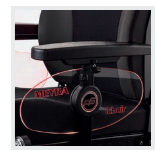
Side guard lighting with custom engraving