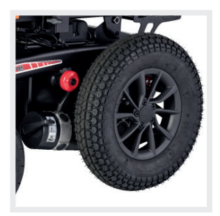
15" drive wheels