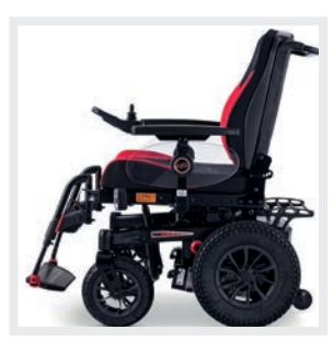
Black- Red RS design