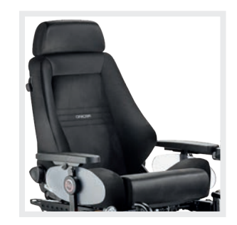
Recaro seat in black leatherette - optional